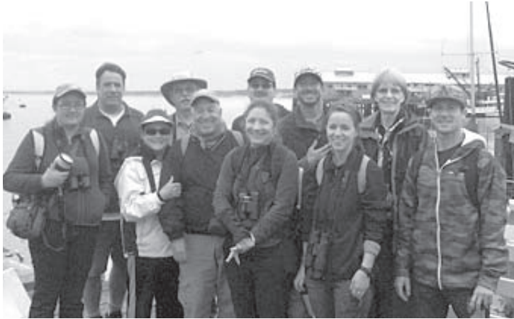
Monterey Seabird Trip, Aug 24, 2014

All of our field trips are open to beginning birders. Anyone with a sense of wonder is welcome to participate.