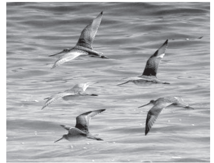
Marbled Godwits at Drakes Bay