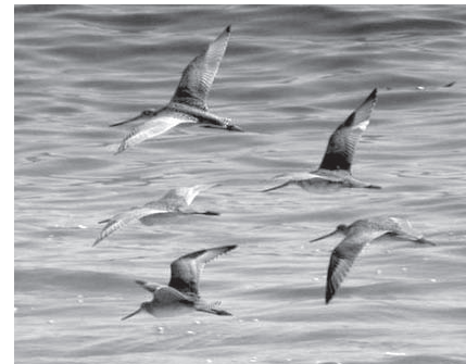
Marbled Godwits at Drakes Bay