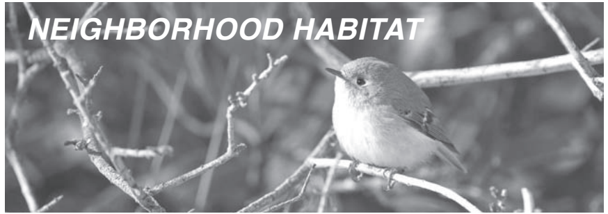
Ruby-crowned Kinglet by Steve King

Altacal is starting a new program in October. It's called the Neighborhood Habitat Certification Program . Our goal is to support local community members who are interested in converting unused lawns to wildlife habitat.