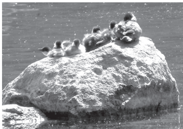
Bufflehead family at Manzanita Lake, Lassen NVP

Saturday, we hiked around Manzanita Lake where we saw quite a few fledgling birds with their parents, including Golden-crowned Kinglets , Orange-crowned Warblers , American Coots , Buffleheads , Pied-billed Grebes , Dark-eyed Juncos and Green-tailed Towhees . We located a Downy Woodpecker nest right beside the trail and a White-headed Woodpecker nest too. An American Dipper juvenile was hiding under a log across the creek and a fledgling Brown-headed Cowbird which was on its own confused us for awhile as it had such a yellowish wash on its chest. We also saw a couple of Vaux's Swifts , Hermit Warblers and Fox Sparrows. Walking towards the Visitor Center, we spotted a Peregrine Falcon , which circled overhead a dozen times giving us great looks! We shared a nice potluck dinner with everyone at the campsite that evening, enjoying birding stories and listening to the Common Nighthawks flying around.