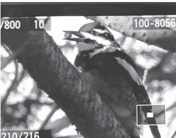
Red-naped Sapsucker, Chico CBC, Dec 17, 2016

T hirty-five people showed up to volunteer for the Chico CBC on a cold morning, but it turned out to be a fine day to volunteer for Altacal Audubon. The highlight was definitely a Red-naped Sapsucker found by Matt, Ken and Jim's team! My team found a Black-throated Gray Warbler at One Mile, and Diego, Cris and Gary got 5 Mountain Bluebirds in Upper Park. We did pretty good on raptors with 14 Bald Eagles , one Golden Eagle , 5 Ferruginous Hawks , 71 Red-Tails , 39 Red-shouldered Hawks , 6 White-tailed Kites , 30 American Kestrels , 2 Peregrine Falcons , 13 Cooper's Hawks , 4 " Sharpies ", 8 Northern Harriers and 4 Merlins . We had 111 species and 25,935 individual birds! We met at Woodstock's Pizza (thanks for the discount Woodstocks!) to tell our stories from the day and tally all the birds.