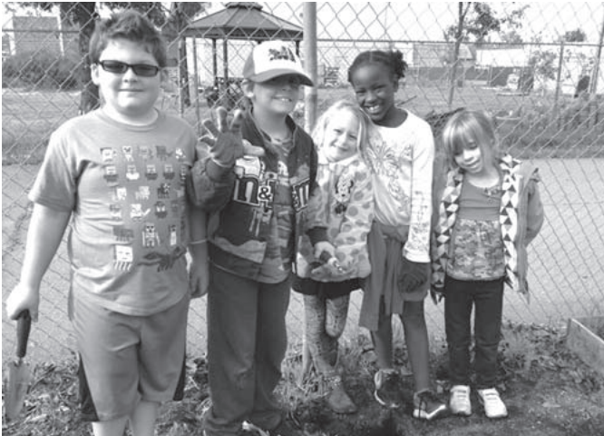
A brilliant team of 'habitat' gardeners at Wildflower School

Local kids at Wildflower School and at the Boys & Girls Club are chipping in to restore our community's wildlife habitat and protect our water. Their enthusiasm is contagious, and a really fun part of Altacal's Neighborhood Habitat Certification Program. This program, which supports the creation of habitat-friendly and water-wise gardens, now includes 220 local gardens with 70 fully certified 'habitat' gardens.