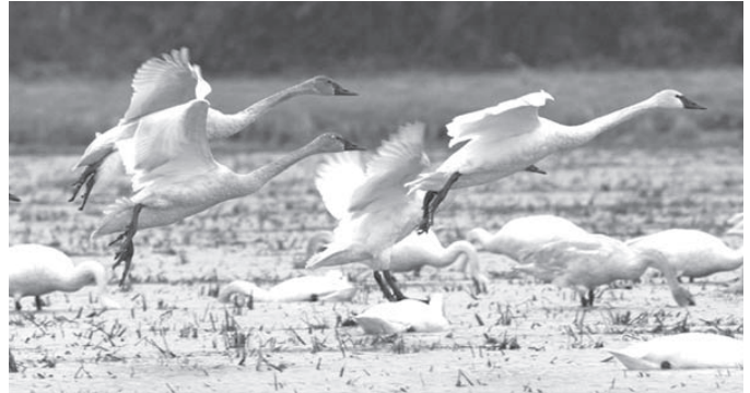
Tundra Swans by Hazel Holby

Swans prefer shallow undisturbed bodies of water such as ponds, lakes, and riverine marshes - but harvested agricultural fields growing winter grain provide excellent foraging spots for these massive birds. One of the benefits swans have from mating for life is learning from their successes and failures each time they raise cygnets. Cygnets stay with their family for up to four years, which helps them remember areas that provide the best habitat for the winter season. This has bonded them to the land they have shared with their ancestors in the Sacramento Valley for generations.