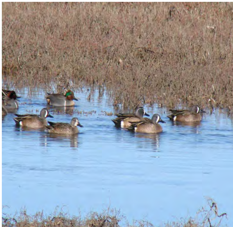
Blue-winged Teals Photo by Scott Huber, January 5, 2007

Reserve, and at Sweetwater encountered a whole flock lone Merlin . On the final get a number of photos of photograph) Sora at Oso Liam, Alita and Kaley a kayak trip to Morro Dunes plovers including Snowy and Black-bellied Plover winged Scoter mixed in