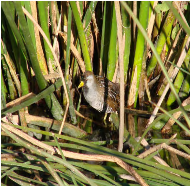
Sora Photo by Scott Huber, January 5, 2007